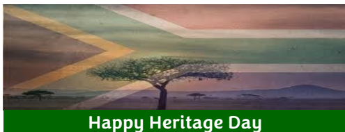
Happy Heritage Day

Latest Finances are available on our website and notice board